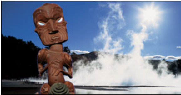
spirit of rotorua

“Rotorua - feel the spirit – Manaakitanga”. It’s our catchcry . . . and it holds a pretty powerful promise as well as an invitation to experience the essence of our extraordinary slice of New Zealand.